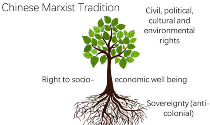
Diagram 7.2 Chinese Marxist Tradition of Human Rights

Once again, I use an image to illustrate Diagram 7.2.